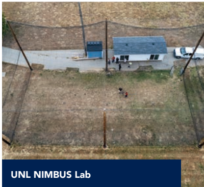
UNL NIMBUS Lab