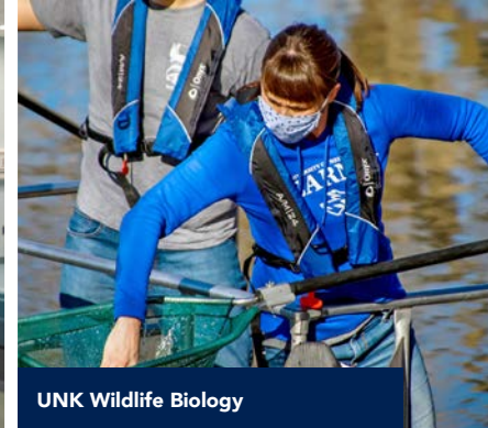
UNK Wildlife Biology