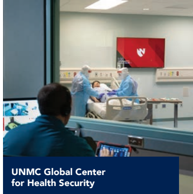
UNMC Global Center for Health Security