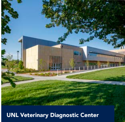
UNL Veterinary Diagnostic Center