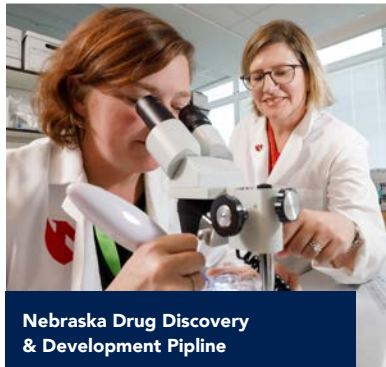
Nebraska Drug Discovery & Development Pipline