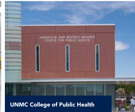
UNMC College of Public Health

Some of the many capabilities, facilities and centers from across the University of Nebraska System ready to contribute to the food, agriculture and environment security focus area. Visit nsri.nebraska.edu/faes for the growing list.