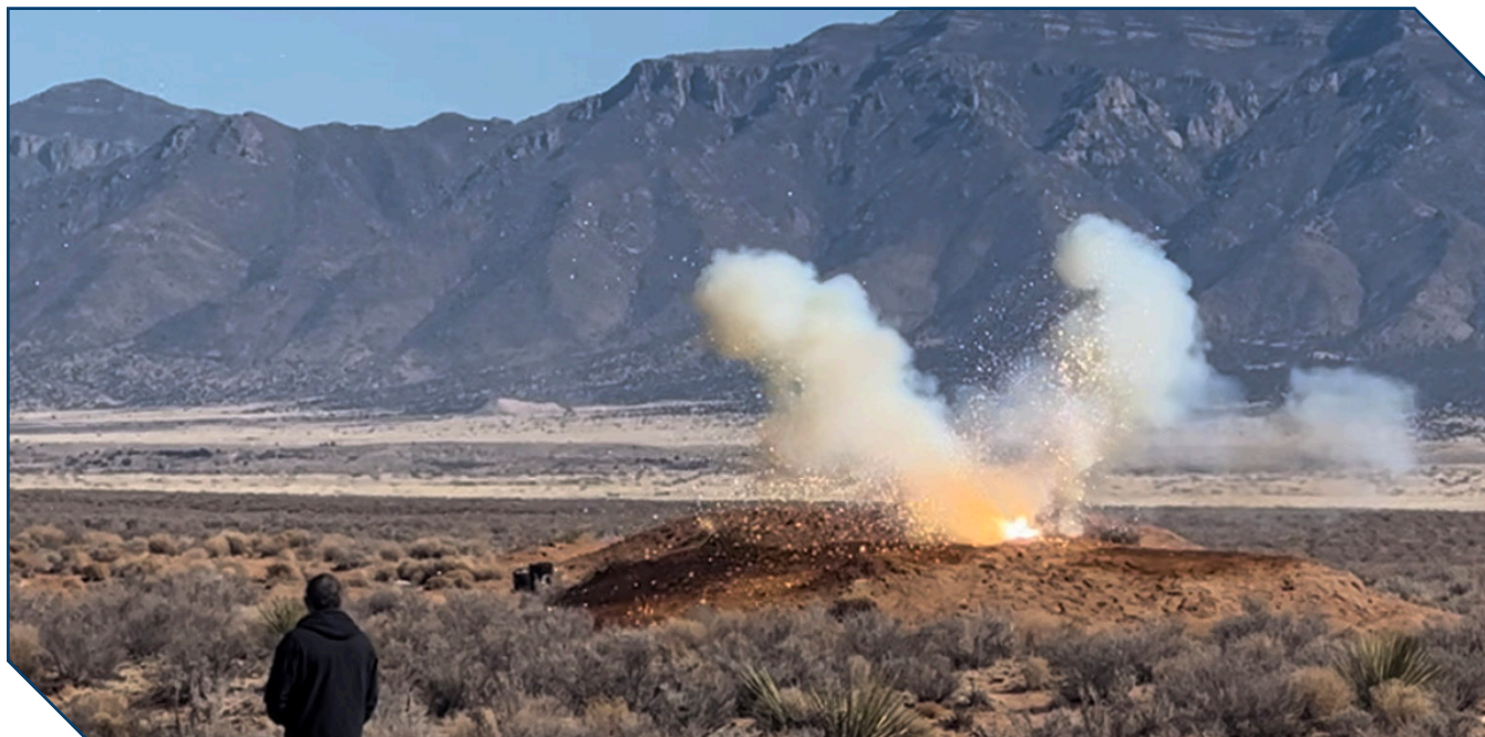
Explosive test conducted on student-made HMEs.

This course is an advanced, fast-paced, hands-on class. It combines eight hours of classroom instruction with 32 hours of hands-on learning. The course is designed to enhance recognition of HME operations and precursors. It also increases understanding of the hazards of precursor chemicals and improvised explosives, field identification methods and comparison of HME sensitivity and performance relative to standard military and commercial explosives.