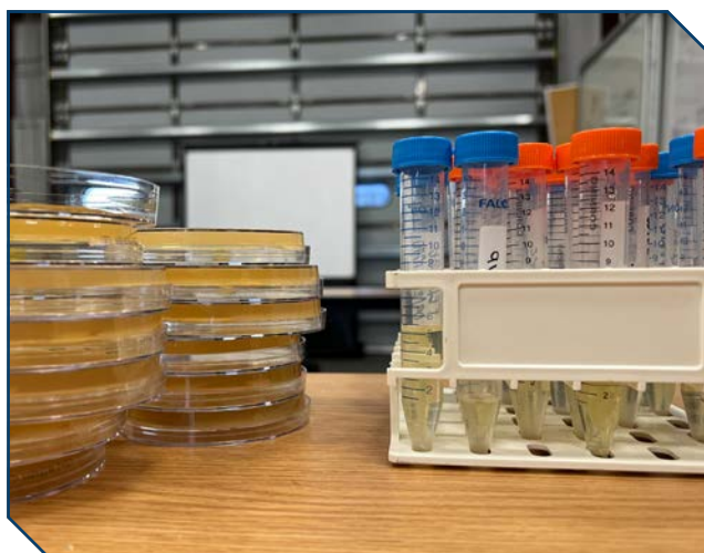
Student Agar plates and Falcon tubes awaiting analysis.

This course combines lecture and demonstration starting with a general overview and history of biological weapons and their use. Students will be informed of the rationale and design of biological agents for use as weapons. Basic principles of growth and associated equipment is presented for various types of biological materials (bacteria, virus, and toxins). The course also includes hands-on demonstrations of biological processes, emphasizing potential hazards and sampling opportunities.