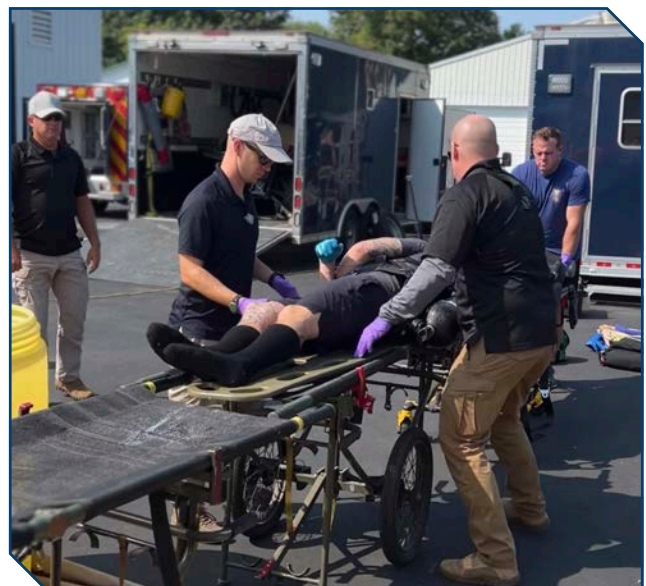
Transfer of downed operator from decon line to receiving medical personnel.

The course includes planning and preparation components to ensure personnel are prepared to integrate into local, regional, or national emergency structures. The course trains emergency medical personnel to prepare an ambulance and crew for transport and rapid decontamination. Participants are also trained in when, where, and how to don and doff Powered Air-Purifying Respirators (PAPR), full-disposable coveralls, and other associated PPE. Hands-on practical experience with: preparing the ambulance, donning and doffing PPE, and the operation and movement of a portable isolation unit.