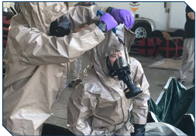
Decon Operator being cutout of PPE.