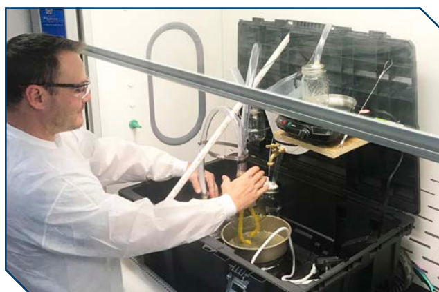
Chemical Signature and Recognition course participant tests portable chemical lab under chemical hood.

Students will receive hands-on instruction on different fentanyl synthesis pathways, production and current trends and sophistication of synthetic opioid clandestine lab operations. All participants will have the opportunity to test current detection and identification methods utilizing their equipment. The course concludes with a practical decontamination demonstration where students will examine the effectiveness of various decontamination methods using a visual stimulant.