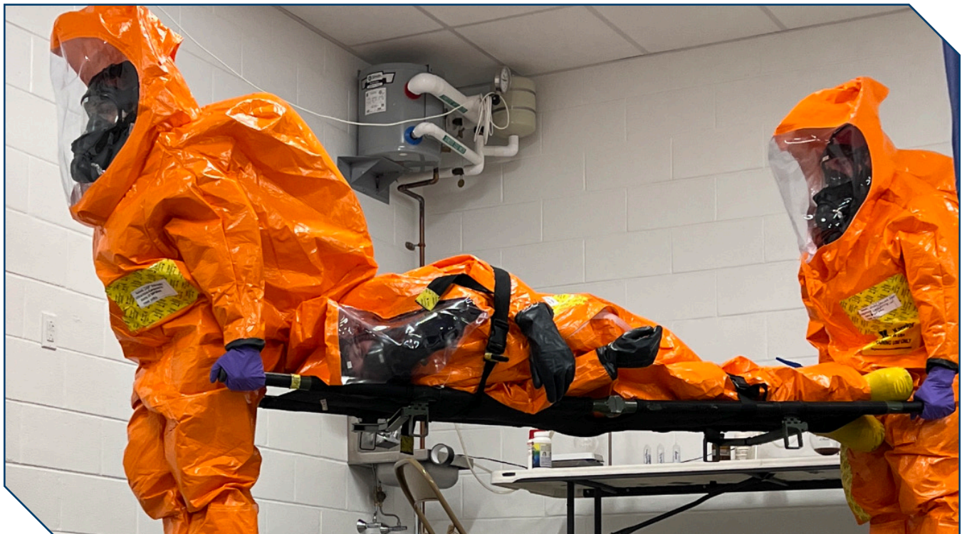
Extraction of downed operator from a hazardous environment.

Objective: Introduce information relevant to the initial assessment and care of casualties from explosives and blast injuries.