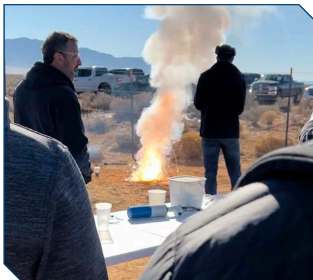
HME chemistry demonstration.

Additionally, mock IEDs with a variety of switches will be demonstrated in order to enhance the hands-on learning of participants. Finally, participants will be introduced to a mock HME lab to give them an idea of what equipment might be found on site.