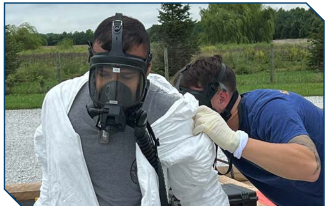
CST Operators utilizing the buddy system to assist with “peel-out” doffing of PPE.