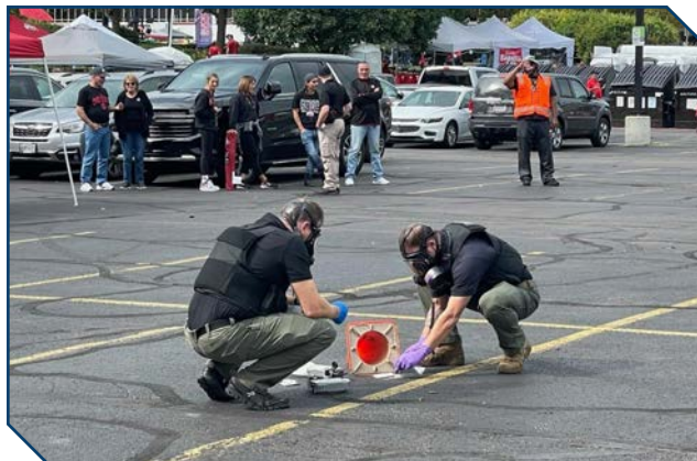
OH 52nd CST analyzing an unknown White Powder using a First Defender RMX Handheld Chemical Identification detector during JHAT Operations.

This course also delves into the development of these weapons and both past and possible use scenarios. The course is readily customized for the first responder, support team member, or the warfighter. It provides a “what to look for” in common chemical weapons synthetic efforts. It serves as the basis for the Improvised and Clandestine Laboratory Course as well as other sampling and analysis courses offered by NSRI. The course can be offered at the Secret or Unclassified level.