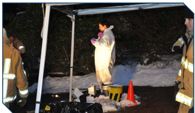
CBRNE threats and environmental conditions are always factors when selecting the proper PPE ensemble.