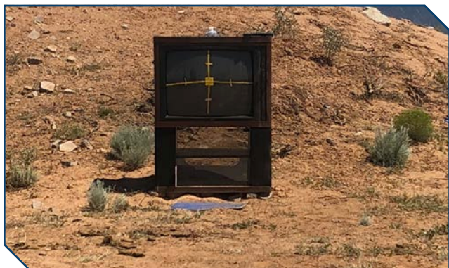
Explosively Formed Projectile (EFP) target demonstration.

Attendees will participate in classroom lecture and practical labs to understand how IEDs function. Students will be exposed to practical exercises, focusing on the identification of an array of IEDs, their components and triggering mechanisms. The course will guide emergency personnel through the attack cycle in relation to the IED manufacturing process while identifying points of observable activity that can be communicated to emergency responders.