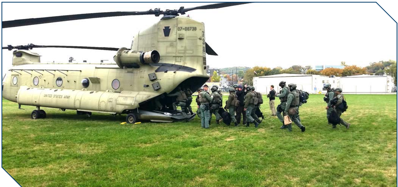
USMS loading CH-47 Chinook for Tactical Response to WMD class exercise.

The culminating event for this course is a full-scale exercise designed to reinforce lessons learned throughout the week. Strong emphasis on interactive and practical exercises. Simulations are an important part of the course. We ensure a challenging but safe learning environment.